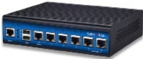
SAVVIUS INSIGHT (177 x 44 x 145.5 mm)

Savvius Insight is a compact, quad-core, six-port, mini network appliance that has no fan or other moving parts, and fits easily into a wiring closet. It includes bridge ports for monitoring the location's Internet connection, and three additional ports for monitoring internal networks. Savvius Insight provides built-in long-term reporting and web-based dashboards for analyzing and displaying network statistics over long periods. Savvius Insight can also be used for packet level network and application troubleshooting by connecting directly to it with Savvius Omnipeek. By installing Savvius Insight in each remote office, network administrators can easily and affordably gain insight into the performance and security of the network and applications at all locations under management. Savvius Insight makes enterprise-class network analytics available in areas that have been under-served until now.